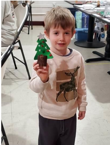
Ornaments to be given to